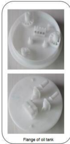
Flange of oil tank