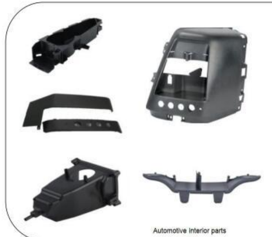
Automotive interior parts