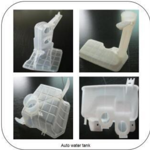
Auto water tank