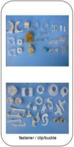
fastener / clip/buckle